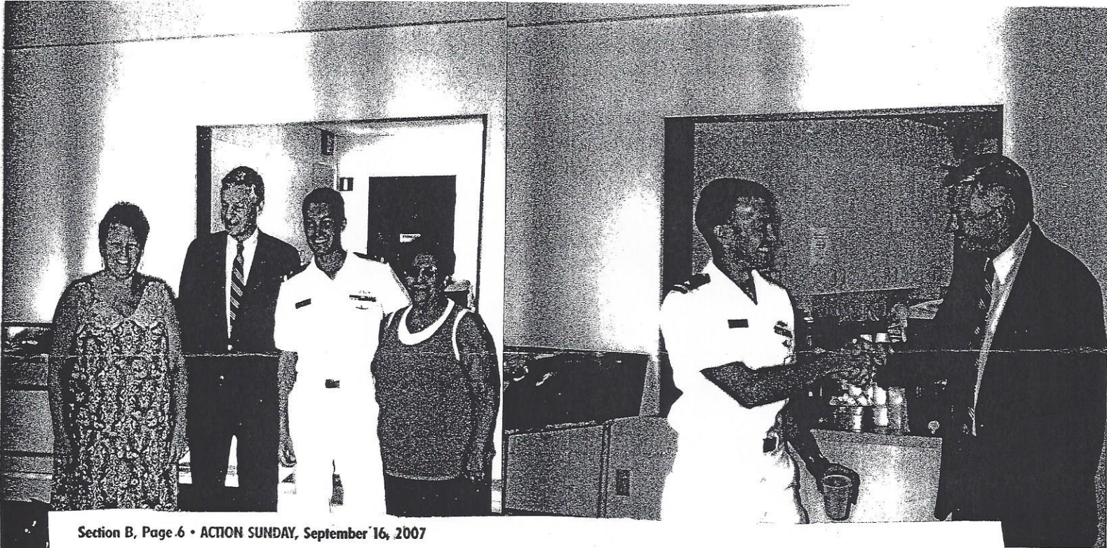
Section B, Page 6 • ACTION SUNDAY, September 16, 2007